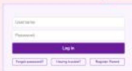
Log in Screen