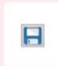
Save your work