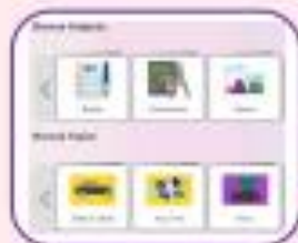
Subjects & Topics